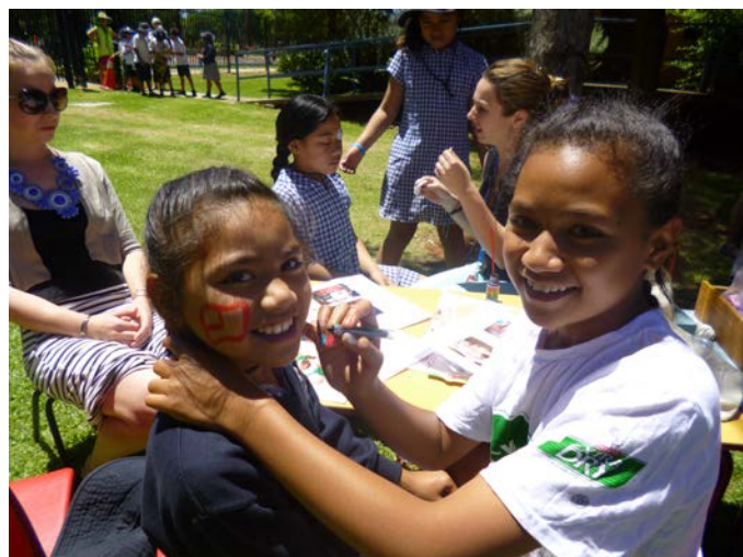
Face painting at the fete!