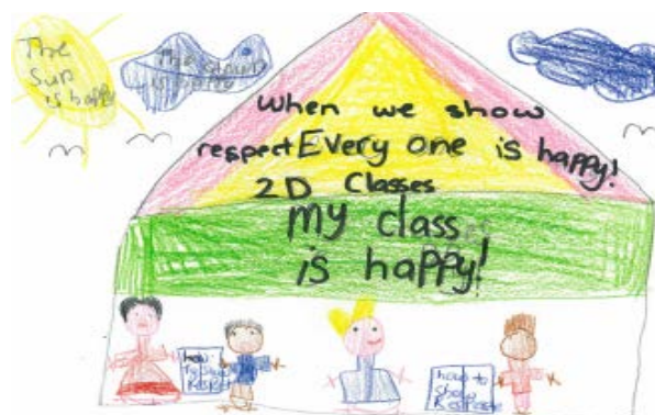
Drawing by Sialalua Asomua 2D

Respect means treating people well even if they are different to you. You can show respect by listening to people when they are speaking. Being nice to people and playing with different people is a way to show respect. You can show respect by using nice words and saying nice things to people. When someone treats you with respect you feel nice and happy so you can treat them with respect too.