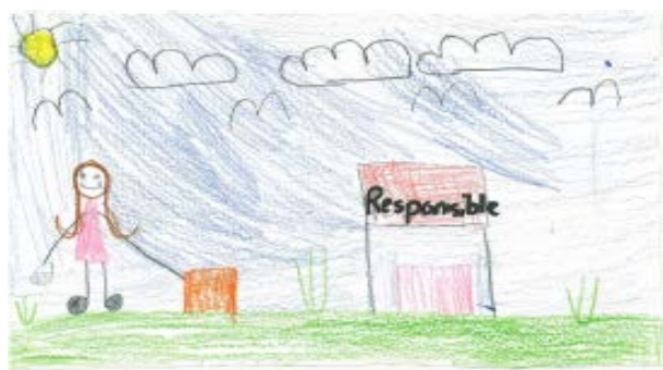
Drawing by Laura Dreyer 2D

Responsibility means looking after yourself by making good choices. You can show that you are responsible by walking on the concrete and by playing safely with our equipment. Playing safely with your friends is a way to be responsible. You can be responsible for yourself by wearing a jumper when it is cold and wearing a hat when it is sunny. If someone is being mean to you then you can say stop and walk away. When you are being responsible for yourself you will be happy and safe.